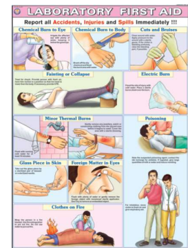
LABORATORY FIRST AID

Reference colours indicated by universal indicator with different acidic or basic substances to show their approximate pH values. Printed on Polyart Synthetic Paper. Size 70 x 100 cm. Code CL03S