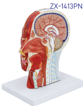
ZX-1413PN Half Head Model with Nerves & Vessels