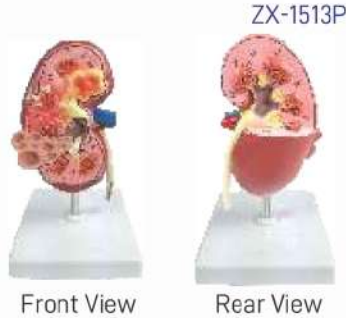
ZX-1513P Kidney Pathologies Model