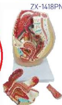
ZX-1418PN Female Pelvis Section Diss. PVC