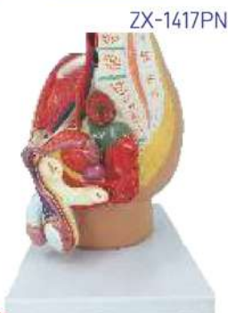
ZX-1417PN Male Pelvis Section Diss. PVC