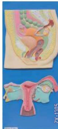
ZX-1305 Human Reproductive System Female