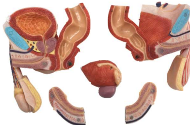
ZX-1419PN Male Genital Organs Model Dissectable