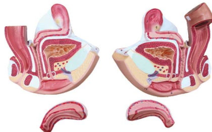
ZX-1420PN Female Genital Organs Model Dissectable