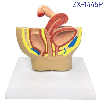
ZX-1445P Female Pelvic Anatomy Model