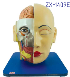
ZX-1409E Head, Brain and Eye