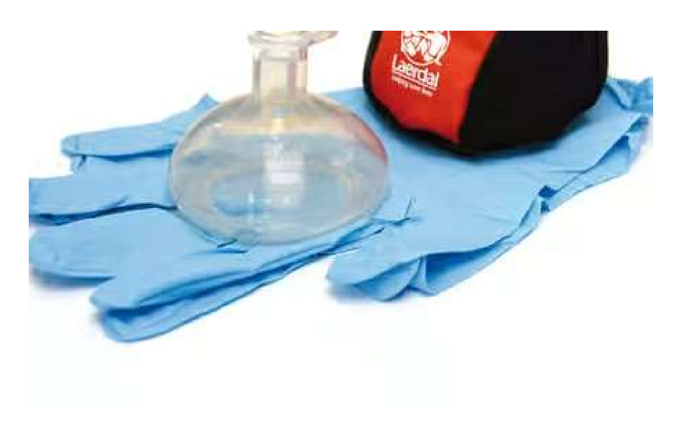
Laerdal Paediatric Pocket Mask